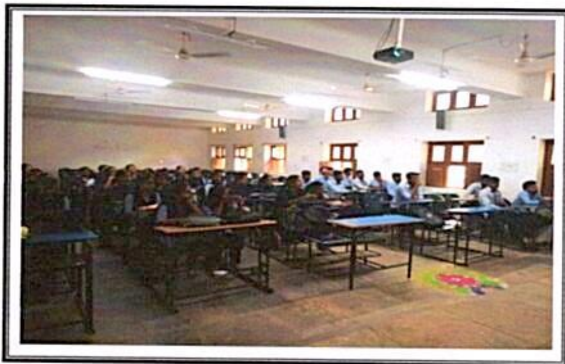
Students are Attended the Function

(Signature) ಮುಖ್ಯ ಸೆಕರೆಟರಿ, ರಾಜ್ಯ ಶಾಸ್ತ್ರ ವಿಭಾಗ ಎಂ. ಜಿ. ಎ. ಸುಬಾಷಿಣ್ಣ ಮುದ್ದೇಬಿಹಾಳ - 586212.